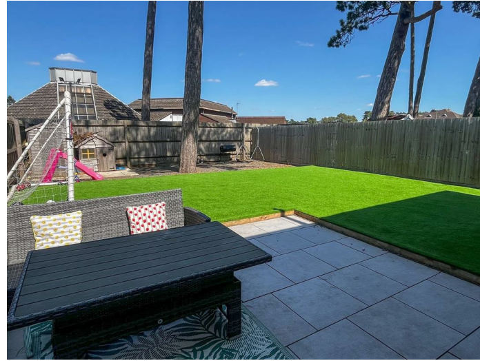
GARAGE With up and over door.